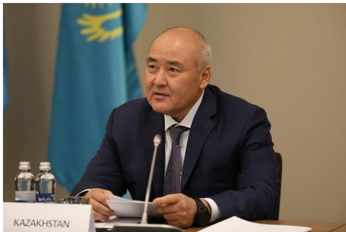
Mr. Umirzak Shukeyev, Deputy Prime Minister and Minister of Agriculture of the Republic of Kazakhstan

The Ministerial Roundtable on Forest Landscape Restoration and the Bonn Challenge in the Caucasus and Central Asia was officially opened by Mr. Umirzak Shukeyev, Deputy Prime Minister and Minister of Agriculture of the Republic of Kazakhstan . On behalf of the Government of the Republic of Kazakhstan, Mr. Shukeyev welcomed all delegates and observers to Astana and wished participants a productive Roundtable. Mr. Shukeyev added that the Republic of Kazakhstan was honoured to host the event.