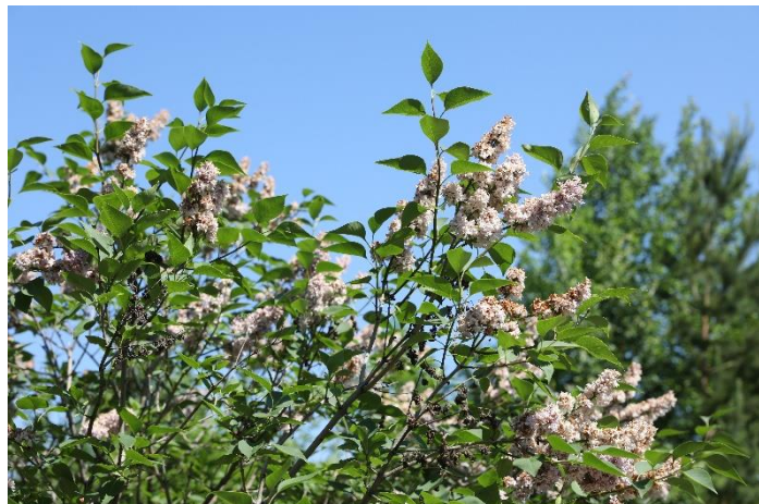
Hungarian lilac ( Syringa josikaea ) at the “Ak kayin” tree nursery

In the growing of seedlings, four-field crop rotation is used with two fallow fields (green manure). Crop rotation refers to the successive cultivation of different crops in a specified order on the same fields, which improves soil structure and fertility. Yellow sweet clover ( Melilotus officinalis ) is used for green manure. In order to create favorable conditions for seed germination and seedling growth, various procedures are implemented. Prior to the emergence of seedlings, for example, these include weeding, soil cultivation and watering. Given the location of the nursery, irrigation is key to the successful growth of the planting stock.