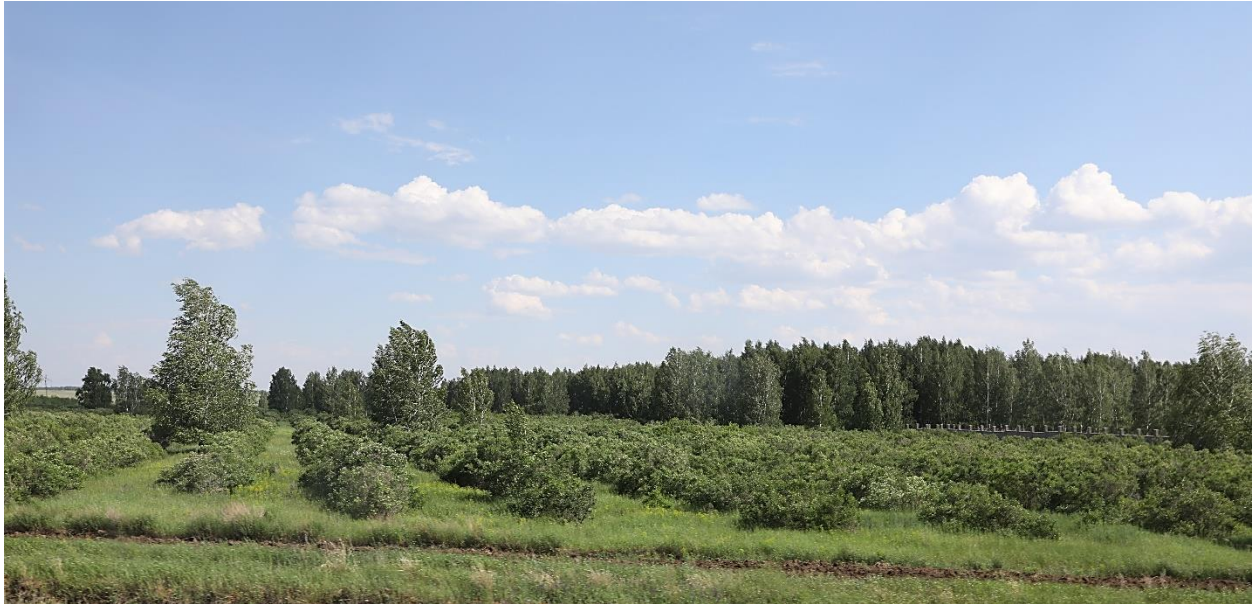
Part of Astana’s Green Belt

The field trip ended at the “Bal Qaragay” recreation centre, one of 28 forest users currently offering health, recreational and sports activities on the territory of the State Forest Fund (the Green Belt) surrounding Astana city.