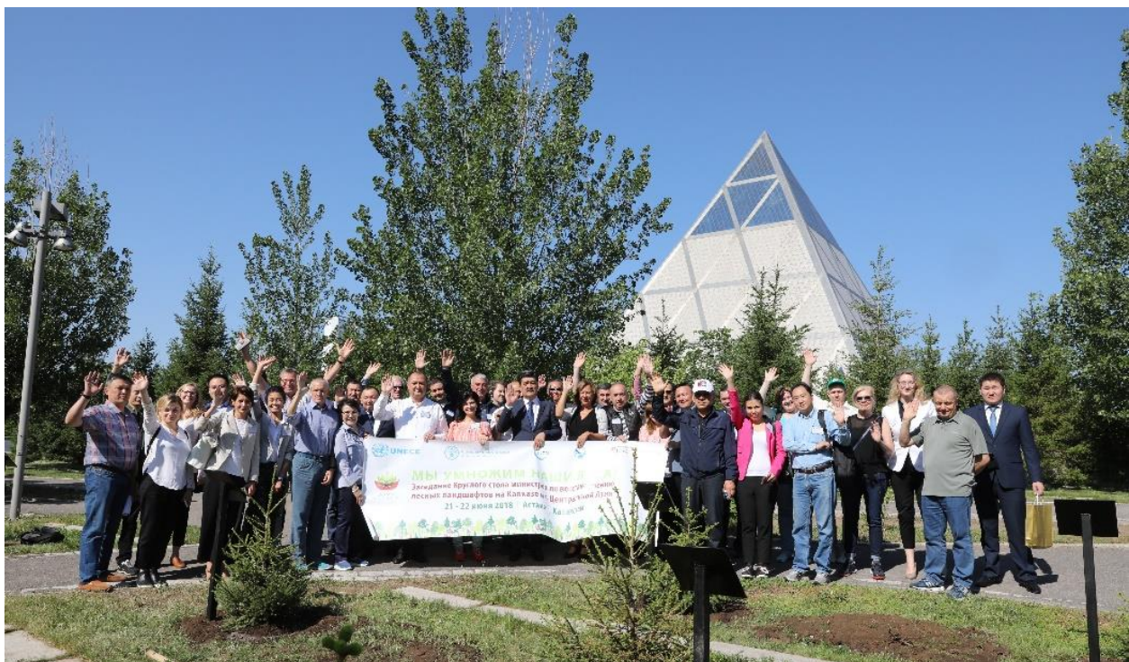
Tree planting ceremony at the Presidential Park of Astana by the Palace of Peace and Reconciliation

In the morning of 21 June 2018, high-level participants of the Ministerial Roundtable took part in a tree planting ceremony by the Palace of Peace and Reconciliation, a 77-metre high pyramid in Astana city celebrating the multicultural and multiethnic character of the Republic of Kazakhstan. Commemorative plaques are now displayed in the Presidential Park of Astana next to trees planted by representatives of Armenia, Azerbaijan, Georgia, Kazakhstan, Kyrgyzstan, Tajikistan, Uzbekistan as well as UNECE, FAO, IUCN, Germany and the Russian Federation. “This [tree planting ceremony] is just a small gesture but it is symbolic of the planting of millions of trees to come in the whole Caucasus and Central Asia region,” commented Ms. Olga Algayerova, Executive Secretary, UNECE. The tree planting ceremony was followed by a field trip to the Green Belt of Astana.